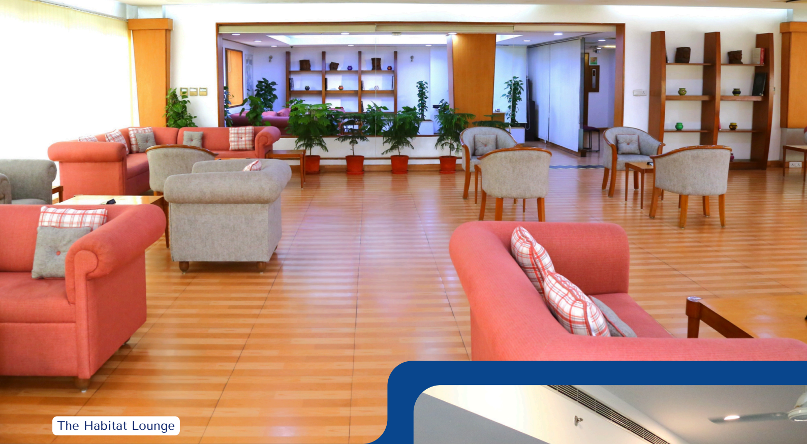
The Habitat Lounge