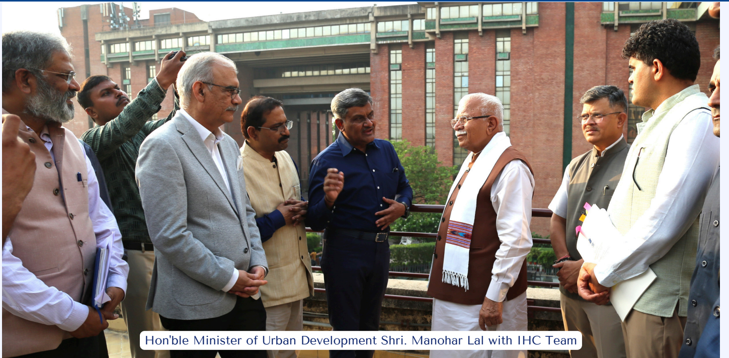
Hon'ble Minister of Urban Development Shri. Manohar Lal with IHC Team