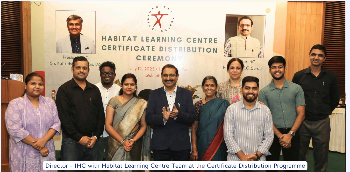
Director - IHC with Habitat Learning Centre Team at the Certificate Distribution Programme