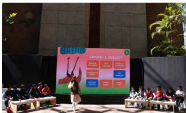
Photography Workshop for hearing impaired children by Akash Ghai

Quiz on Sustainability (pop culture, movies, geography, personalities, books and art) by Quizcraft